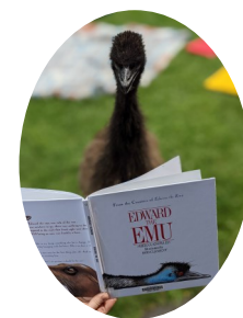
Oscar the Emu— visitor to stories in the park

Many thanks to all of our volunteers for their time and efforts assisting us with programs, library functions and more. We appreciate you!