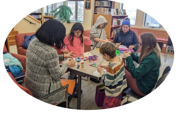
Family program with the Johnson Art Museum