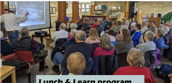
Lunch & Learn program