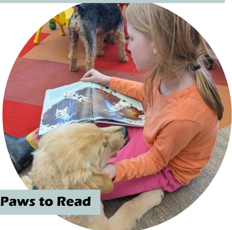
Paws to Read