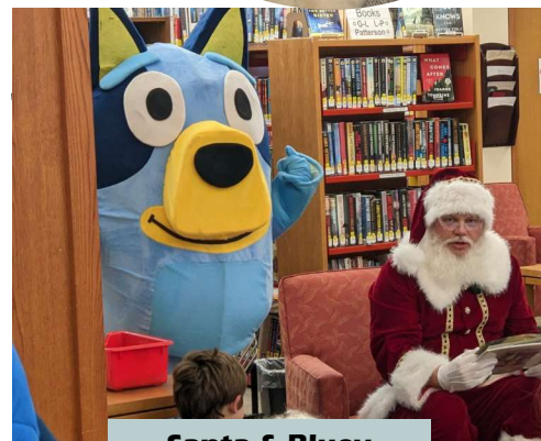
Santa & Bluey